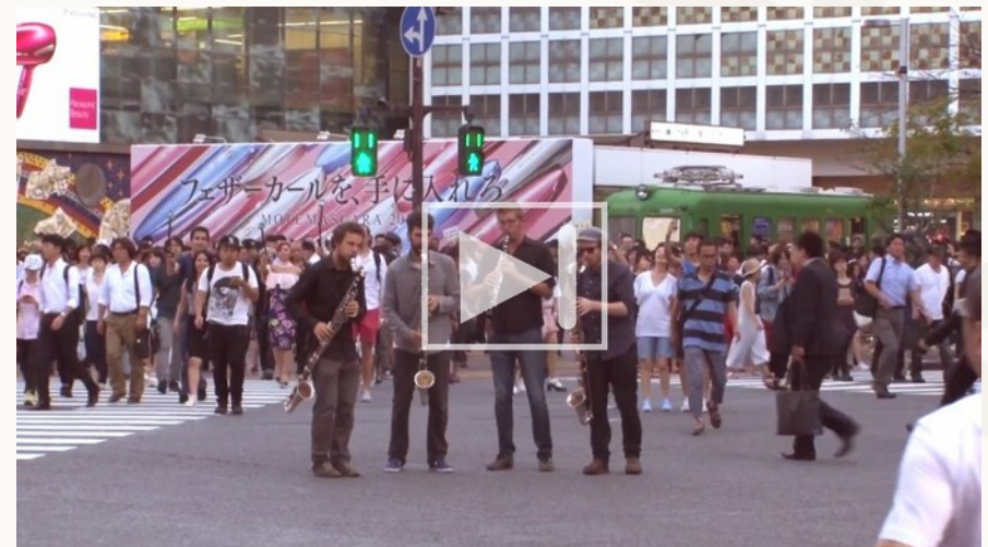
Videoclip „Shake for your Sake“ Around Tokyo