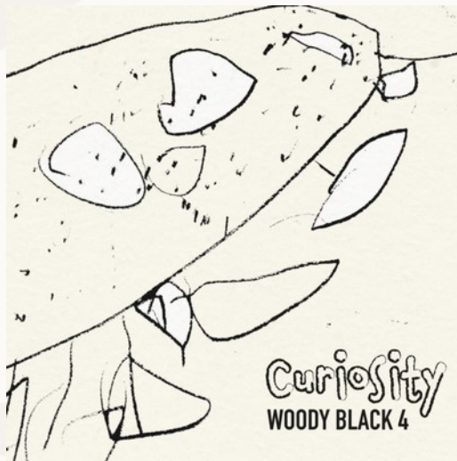
Curiosity (Unit Records, 2017)

„On “Curiosity” they set off a musical firework that is colourful, spectacular, and completely new. The incredibly layered and unbelievably varied sound combined with a high level of musical finesse makes all of the difference here.”