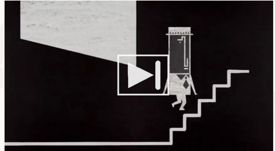
Mr. Bassclarinet Animation Series