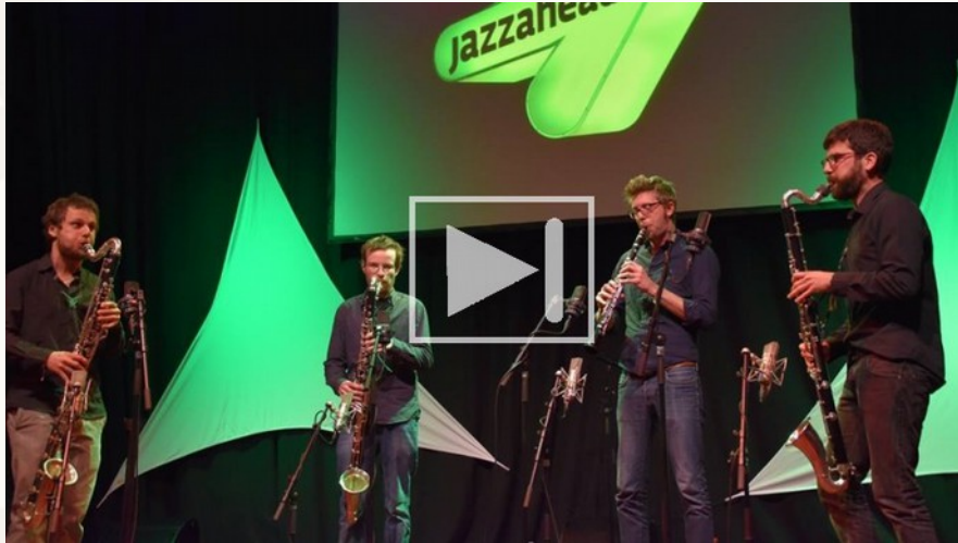
Teaser at Jazzahead! 2016